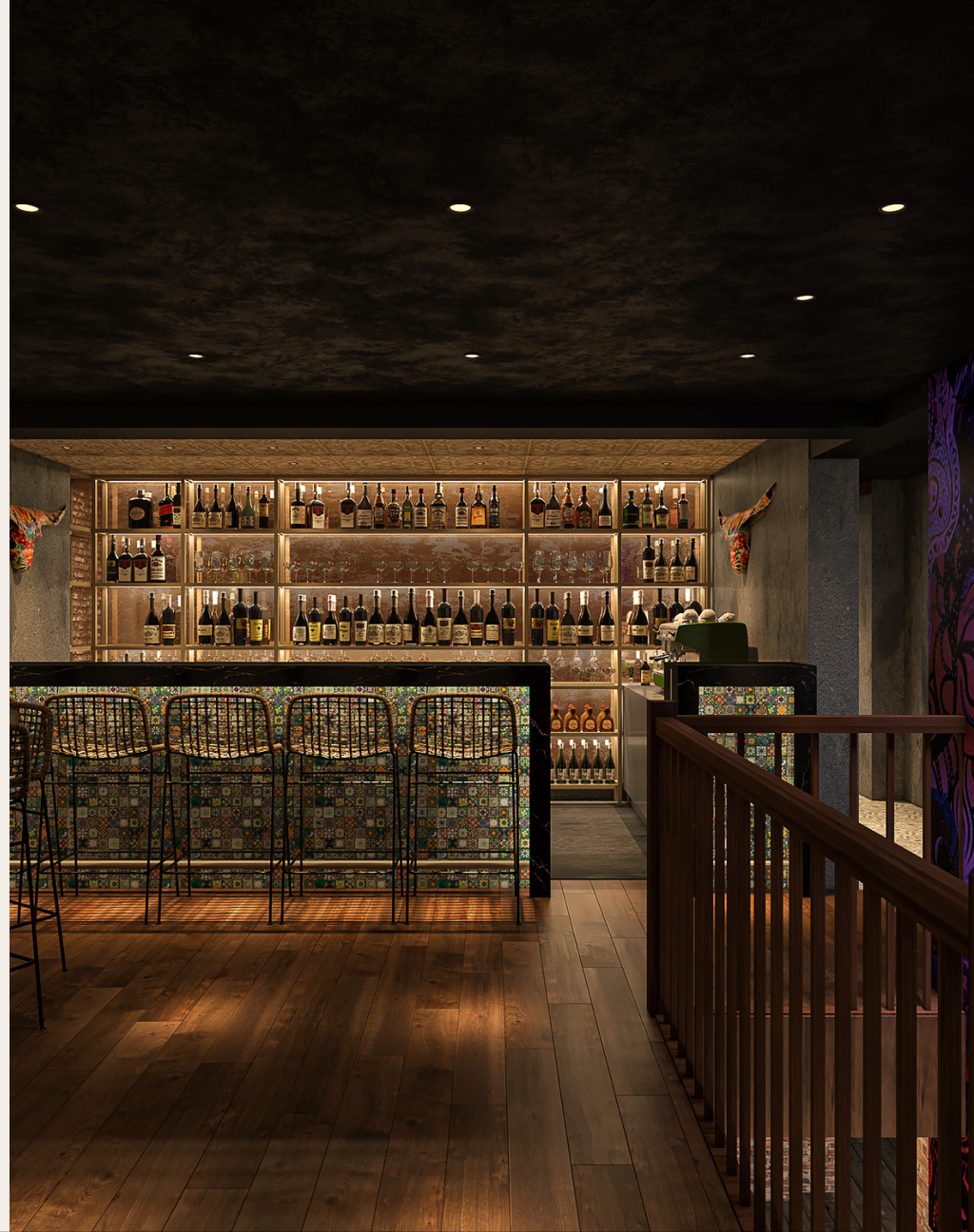
THE BAR AND LOUNGE